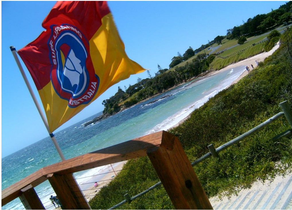
BERMAGUI SLSC COMMUNITY NEWS